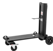
X3 4-wheel Trolley

Classic analog remote control for GXe Series 5 torches for memory channel or wire feeding adjustment. The new shape is lightweight, durable, and easy to handle with welding gloves. The channel step click can be removed by adjusting it with a small screwdriver. Plastic is more robust, and orange potentiometer fixing is improved. Compatible with Kemppi machines with remote control support.