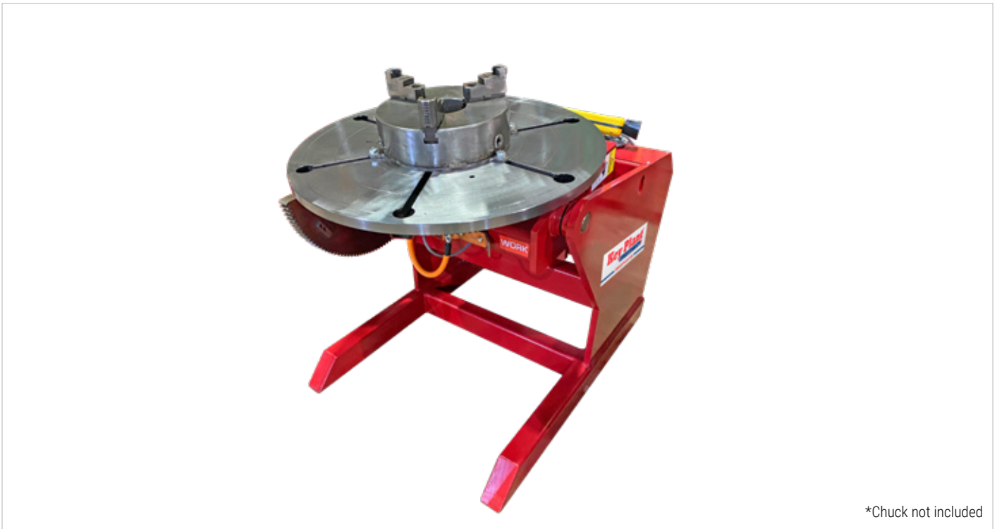
*Chuck not included

The perfect automated solution for lifting, tilting and rotating workpieces of various capacities, shapes and sizes 360 degrees. Our cost-effective, robust and reliable LCVP range of positioners are designed to significantly increase the quality and consistency of your weld, by hand and automation.