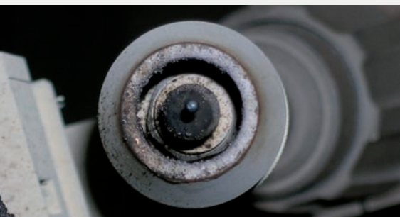
The difference, with and without the coating, after 75 minutes of welding