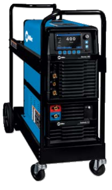
Maxstar® 400 Tigrunner®