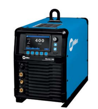
Maxstar® 400 machine only