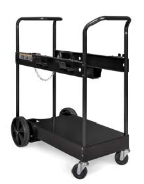
Runner<sup>™</sup> Cart included into each Tigrunner Designed to accommodate Dynasty 400/800 or Maxstar 400 power sources and a Coolmate<sup>™</sup> 3.5 Cooler. Cart features single cylinder rack, foot pedal holder, three cable/torch holders,