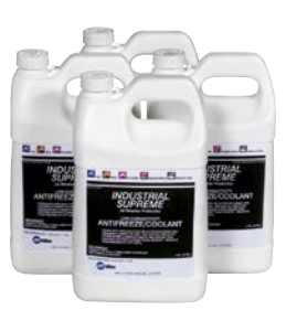
Low-Conductivity TIG Coolant 043810

Must be ordered in quantities of four. One-gallon recyclable plastic bottle. Miller coolants contains a base of ethylene glycol and deionized water to protect against freezing to -38°C or boiling to 108°C.