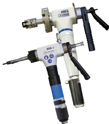
BRB 2 and BRB 4 Pneumatic with clamping system "Standard"