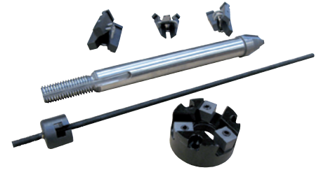
Retrofit kit BRB Standard “Dimension”

Retrofit kits “Dimension” for BRB 4 with drive version Pneumatic/Auto on request.