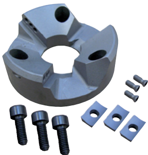
Bevel cutter head for BRB 4