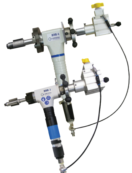
BRB 2 and BRB 4 Pneumatic/Auto with clamping system "NC"