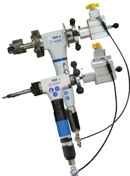
BRB 2 and BRB 4 Pneumatic/Auto with clamping system "Standard"