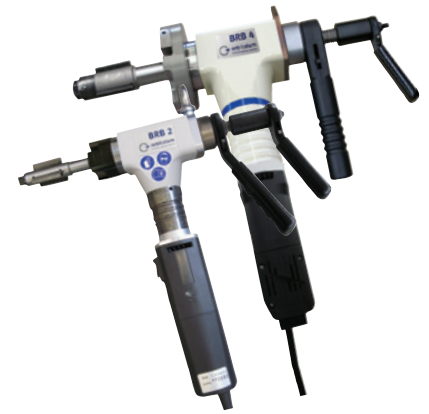
BRB 2 and BRB 4 Electric with clamping system "NC"

A detailed description of the machine, technical specifications and scope of delivery see on page 51. Please specify the required clamping system ("Standard" or "NC"), the application kit (Kit 1 to Kit 5) as well as the drive version (Electric, Pneumatic or Pneumatic/Auto) with your purchase order.