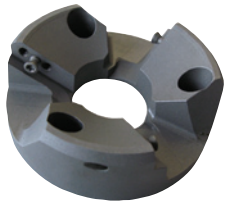
Bevel cutter head for BRB 2