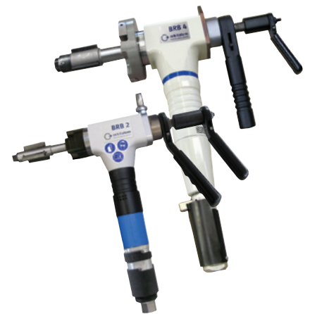
BRB 2 and BRB 4 Pneumatic with clamping system "NC"