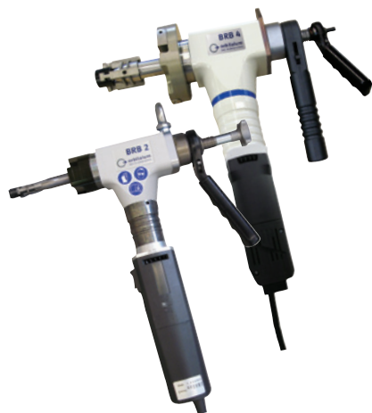
BRB 2 and BRB 4 Electric with clamping system "Standard"