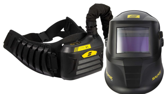
EPR-X1 with Savage A-40 Air Helmet