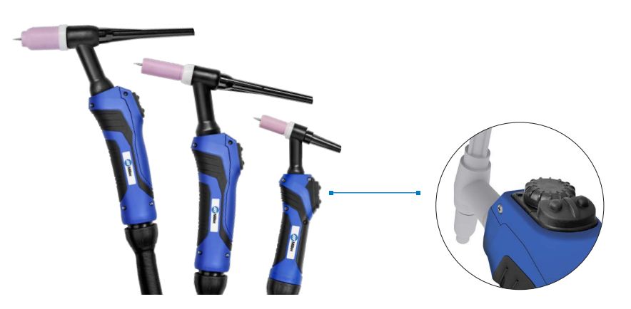
*Remote current control from the thumb wheel, available as an option on all models

The TIG torches can be configured with a standard torch head or a flexible alternative. The ergonomic handle can also be fitted with a remote control for adjustment of the weld current at the point of welding.