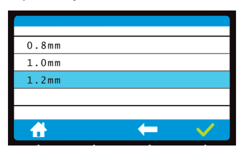
Step 4: Select your wire diameter