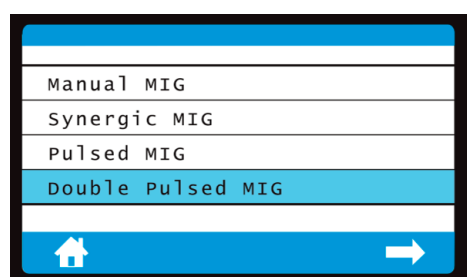
Step 1: Select your process