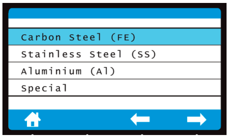
Step 2: Select your base material