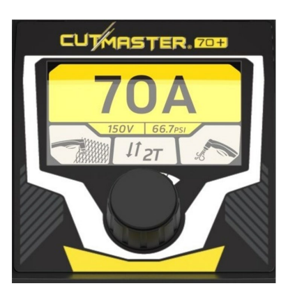
Simple and intuitive TFT LCD panel

Cutmaster 70+ is the perfect combination of power and portability for hand-held plasma cutting machines. Plus means more, so we've added a user-friendly 10.9 cm (4.3 in.)TFT LCD screen and upgraded features that give you even more control and flexibility to master any pierce and cut up to 19 mm. Together with the SL60 1Torch, it all adds up to the total plasma cutting package.