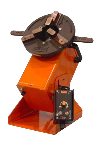
Table on the Gullco Model GP/GPP-200 Series of Welding Positioners (above left) is designed for mounting the WPG-250 Welding Gripper as indicated.

KAT, KBM, MOGGY, KATBAK & SAM are registered trademarks of Gullco Enterprises Limited Distributed by: