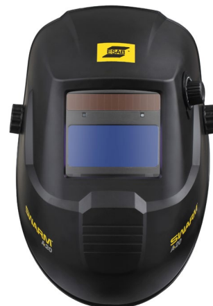
SWARM A20 front view