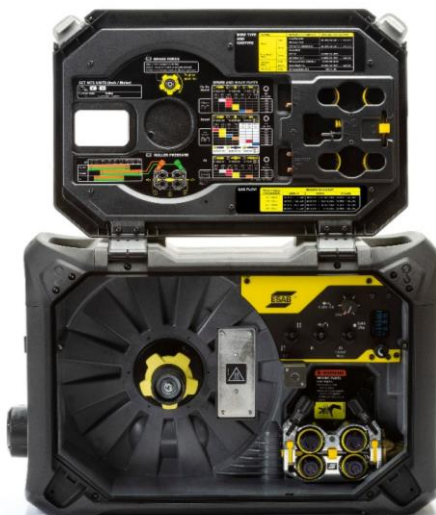
Internal LED lights and integrated storage for wear parts in lid