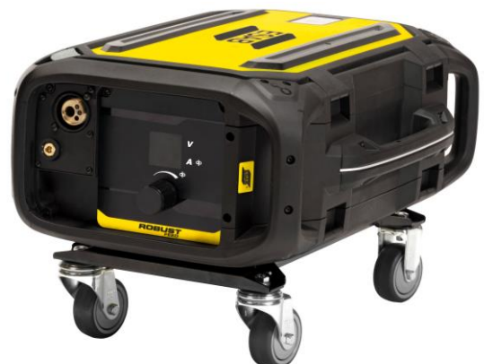
Wheel Kit works with feeder horizontal or vertical